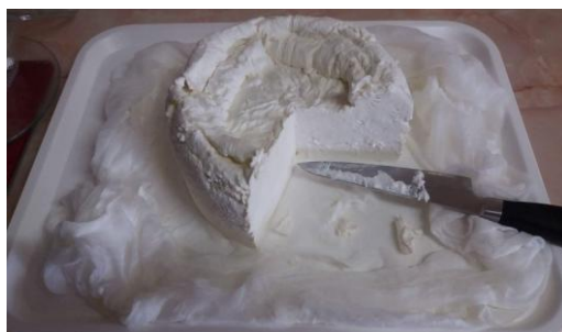
Fig. 6 Cheese portioning