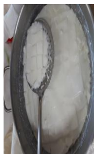
Fig. 4 and Fig. 5 Curd and curd cubes