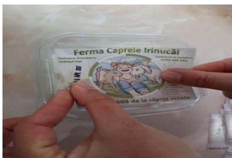
Fig. 8 Labelling

To effectuate the determinations, were subjected to analysis a number of 10 samples of goat cheese traditionally obtained. To present the product quality we aimed to determine the most important physical-chemical parameters.