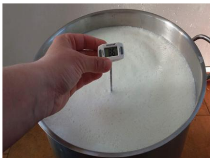
Fig. 1 Milk pasteurization

7. Labelling , casseroles with cheese are labelled with individual sticks, on this are marked the following: product name, producer, address and telephone number, fabrication date, shelf life time, storage temperature and the ferments utilised for product obtaining (fig. 8). Labels are daily stamped with the date in which the product was obtained.