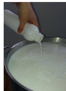
Fig. 2 and Fig. 3 Milk insemination